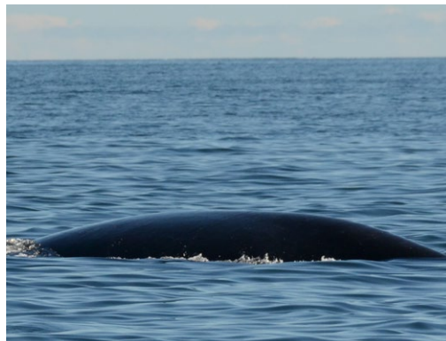
No dorsal fin, smooth black back

ADULT LENGTH MEASURES: 14-17 METRES, 40-50 FEET