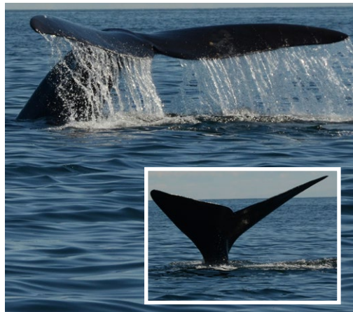
Tail: black, deeply notched, raised when diving