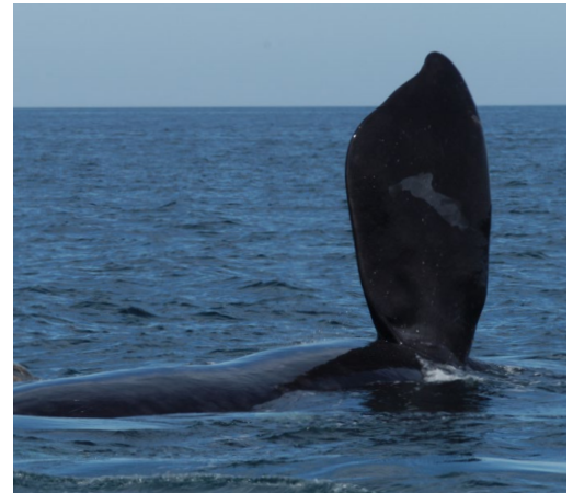
Flippers: broad, black and spatula shaped

ADULT LENGTH MEASURES: 14-17 METRES, 40-50 FEET