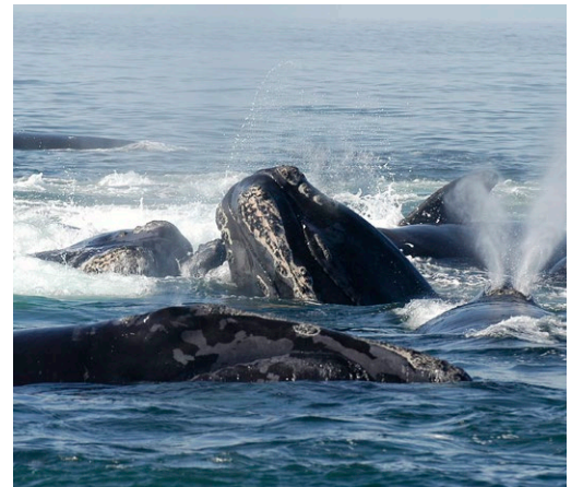
Can be in social groups of 5-30 whales