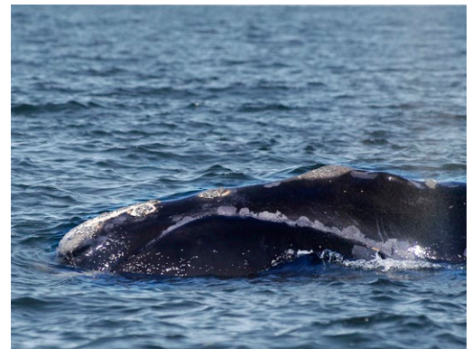
Whitish growths on top and sides of head