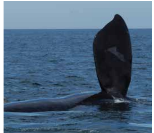
Flippers: broad, black and spatula shaped

ADULT LENGTH MEASURES: 14-17 METRES, 40-50 FEET