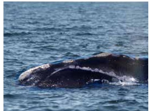
Whitish growths on top and sides of head