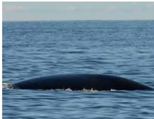
No dorsal fin, smooth black back

ADULT LENGTH MEASURES: 14-17 METRES, 40-50 FEET