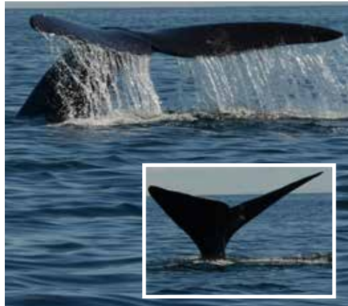
Tail: black, deeply notched, raised when diving