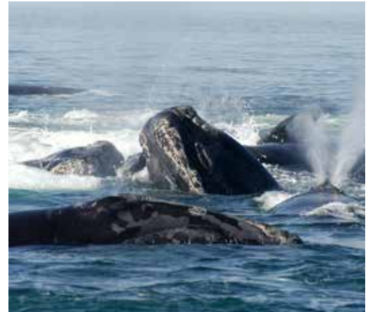
Can be in social groups of 5-30 whales