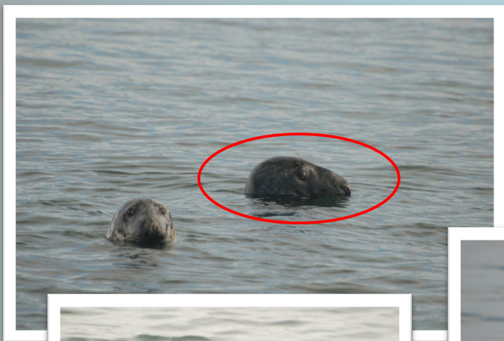
Female grey seal