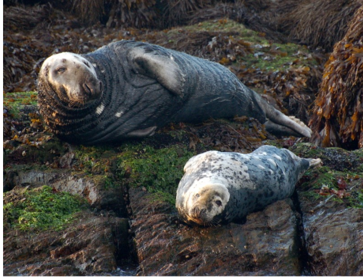
Male (behind) and female grey seal

Males measure up to 2.3 m (7.5 ft) in length - weigh 300-350 kg (660-770 lbs)