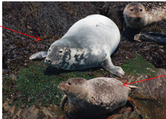
Female harbour seal